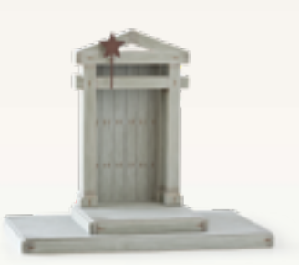
26106 Crèche Height: 43.0cm, Length: 51.0cm Depth: 29.0cm