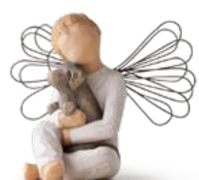
26062 Angel of Comfort Offering an embrace of comfort and love Height: 8.0cm