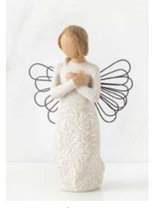
26247 Remembrance Memories... hold each one safely in your heart Height: 13.5cm