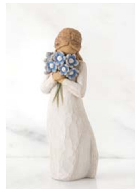
26454 Forget-me-not Holding thoughts of you closely Height: 13.5cm