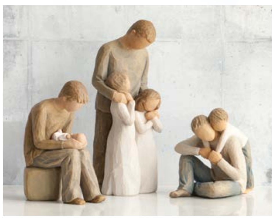
26129 New Dad In awe and wonder of what's to come Height: 14.0cm