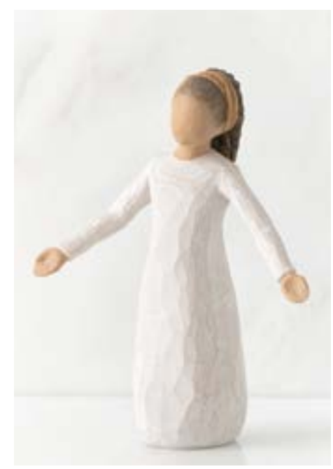
26186 Blessings Each day, unexpected blessings Height: 14.0cm