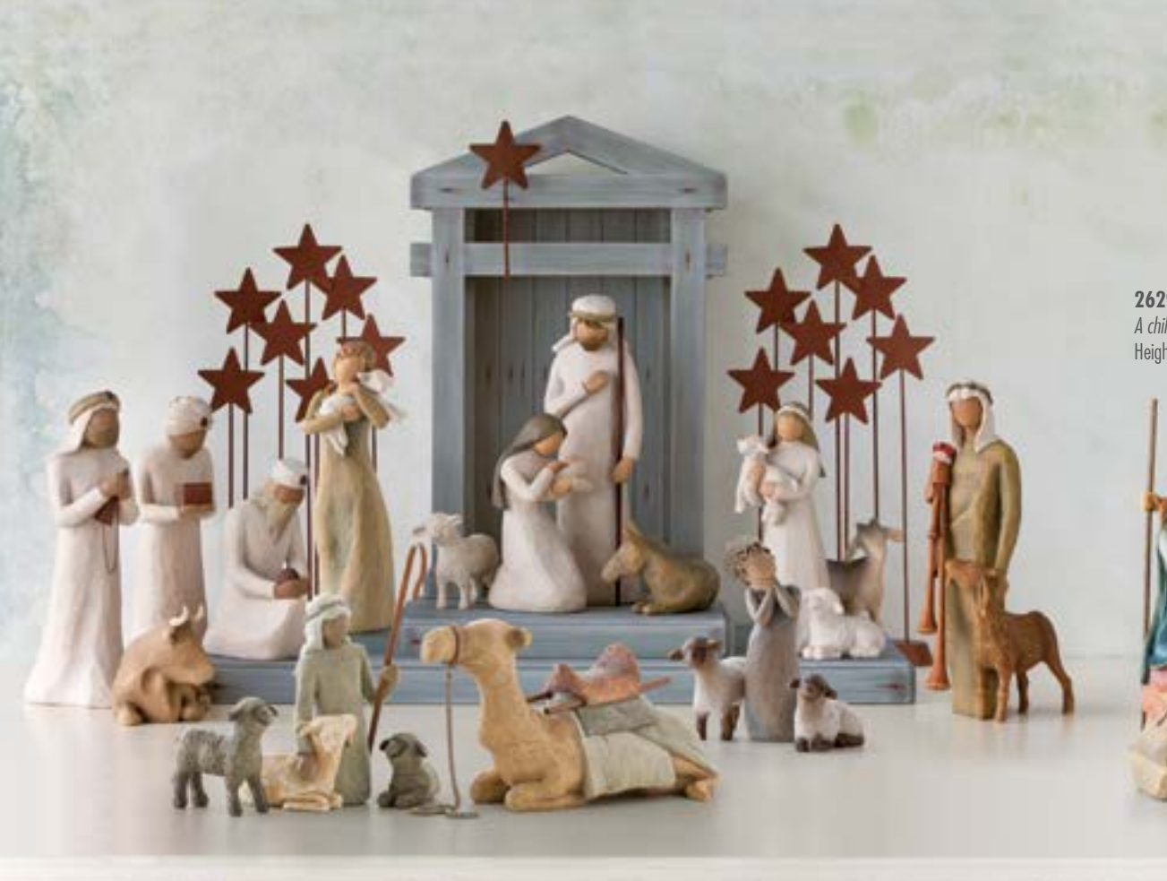
26290 The Holy Family A child is born Height: 19.0cm