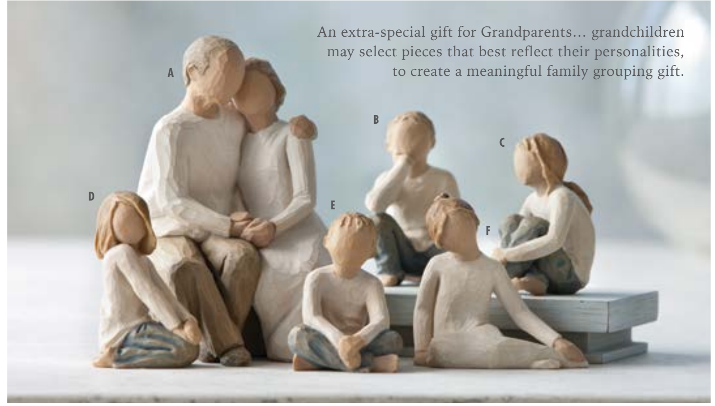
A. 26184 Anniversary Love ever endures Height: 15.0cm 👚