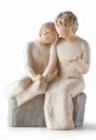
26244 With my Grandmother The best gift is time spent with you Height: 14.5cm