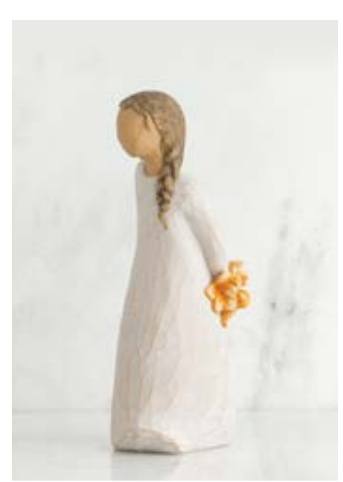
27267 Thank You So appreciative of all you do! Height: 14.0cm