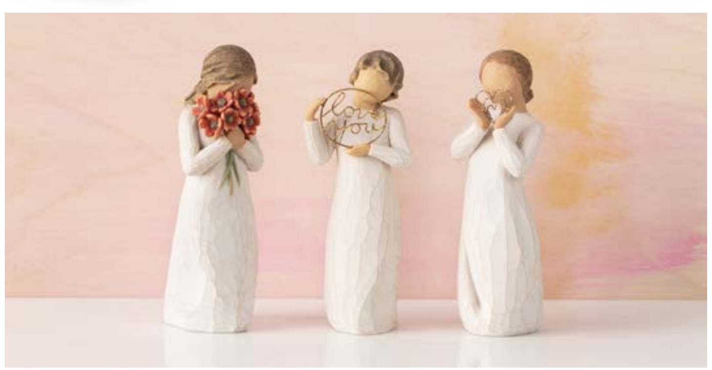
26233 Surrounded by Love Abundant love surrounds you Height: 13.0cm