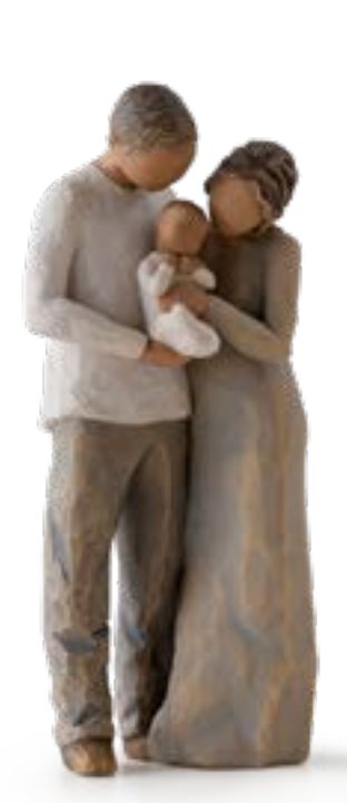
27268 We are Three It used to be just you and me. Now we are three — a family! Height: 22.0cm