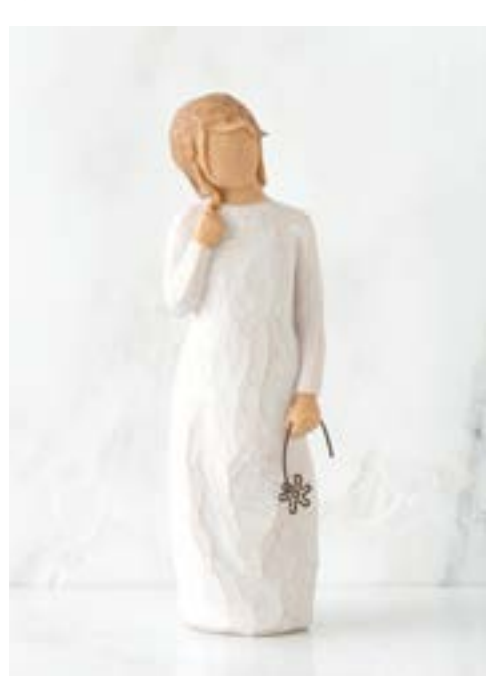
26171 Remember Always, I will remember... Height: 14.0cm