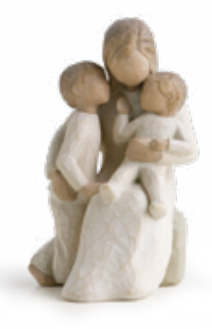
26100 Quietly Quietly encircled by love Height: 13.5cm