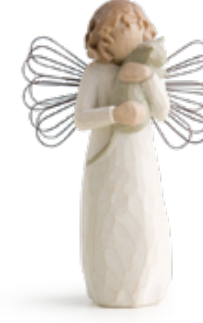
26109 With affection