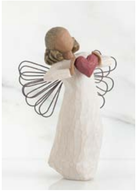
26182 With Love You are loved Height: 13.5cm 👚