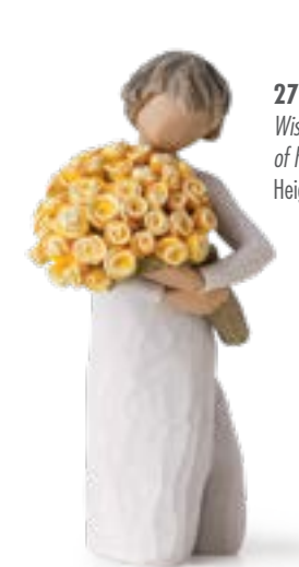
27462 Good Cheer! Wishing you sunny days of happiness Height: 14.0cm