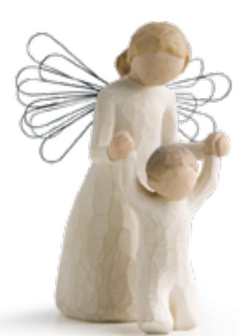
26034 Guardian Angel May you always have an Angel to watch over you Height: 13.0cm