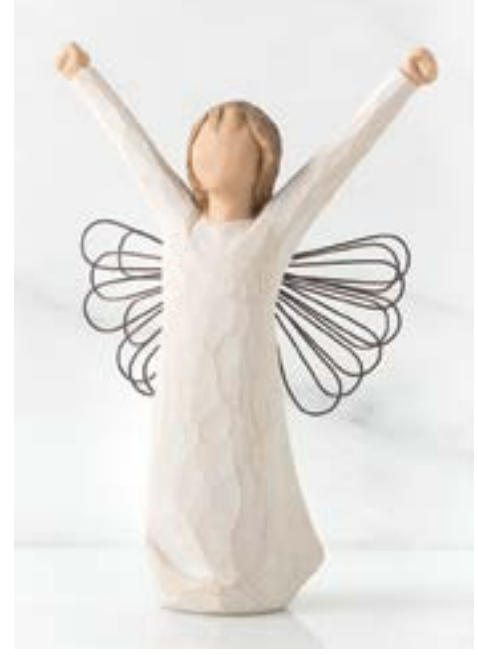
26149 Courage Bringing a triumphant spirit, inspiration and courage Height: 14.5cm