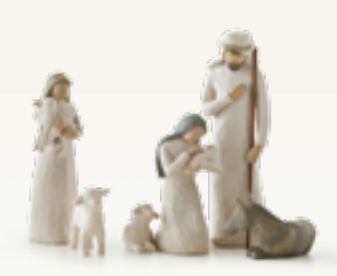
26005 Nativity Behold the awe and wonder of the Christmas Story Maximum Height: 23.0cm