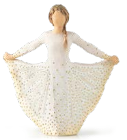
27702 Butterfly Resilient, determined, courageous and beautiful... You have the qualities to transform your world Height: 16.5cm