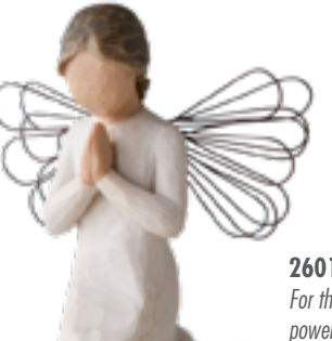
26012 Angel of Prayer For those who believe in the power of prayer Height: 10.5cm