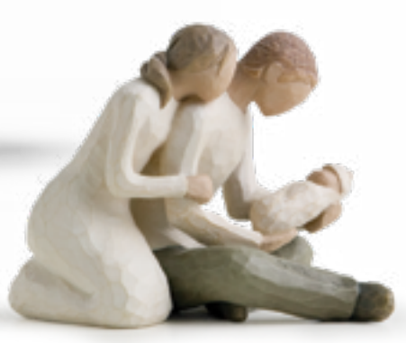
26029 New Life Celebrating the miracle of new life Height: 12.5cm