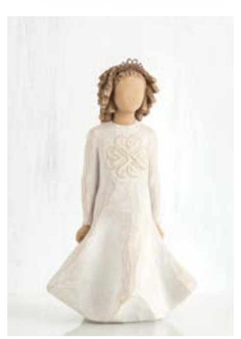
26245 Irish Charm May luck and laughter light your days! Height: 13.5cm