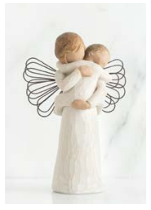
26084 Angel's Embrace Hold close that which we hold dear Height: 14.0cm