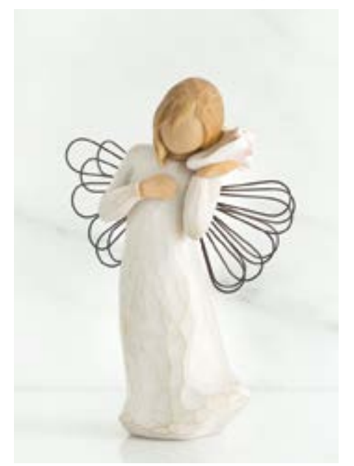
26131 Thinking of You Keeping you close in my thoughts Height: 13.5cm