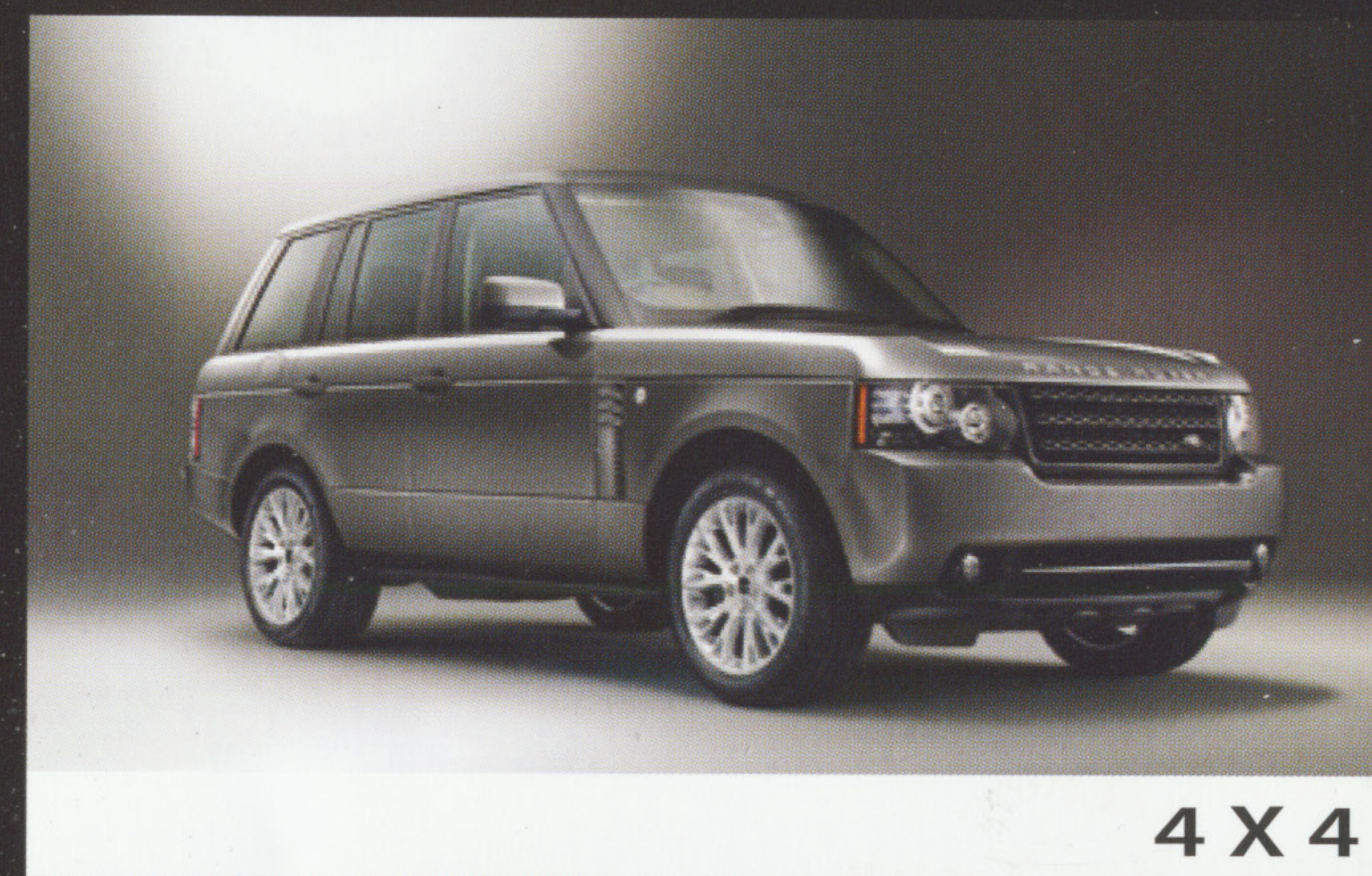
4 X 4

After a consultation in which the specifics of the vehicle are considered we will create a custom remap profile. We will discuss the specific situations where for example extra power and torque are required for moving heavy loads, running optimised acceleration or experiencing a wider torque window.